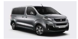
Artense Grey (Grey)