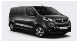
Platinum Grey (Grey)