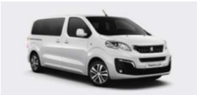
Bianca White (White)

AVAS聲學車輛警示系統會於行駛 30公里/小時的速度時激活，低速行駛時發出聲音，讓車外行人聽見，以確保安全。